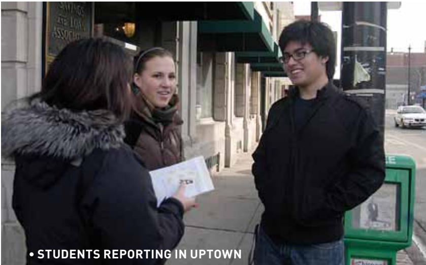
• STUDENTS REPORTING IN UPTOWN

As a sophomore, you will sharpen your journalism skills as you report from one of Medill's storefront newsrooms in Chicago's multi-ethnic neighborhoods. After that you can dive deep into a specific medium, such as print, web or broadcast.